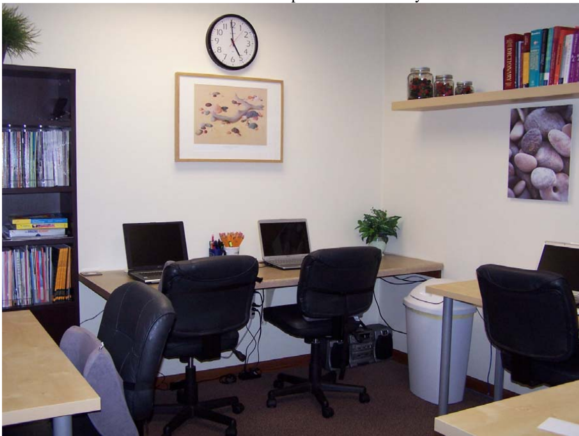
Our computer lab and library

Please see the current River Rock Institute of Electrology Catalog for the most up-to-date policy information.