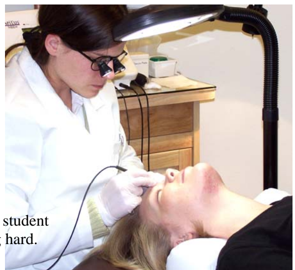
An actual student working hard.

The candidate will be given a written and practical assessment in person at the River Rock Electrology Institute that is commensurate with the final exams our students would take. If the candidate passes the assessment, they will be allowed to sit for Wisconsin State Board Exams.