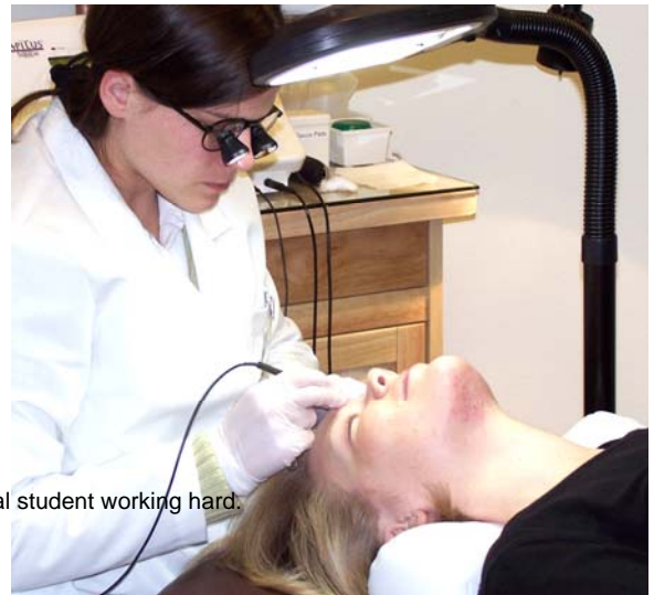
An actual student working hard.

The candidate will be given a written and practical assessment in person at the River Rock Electrology Institute that is commensurate with the final exams our students would take. If the candidate passes the assessment, they will be allowed to sit for Wisconsin State Board Exams.